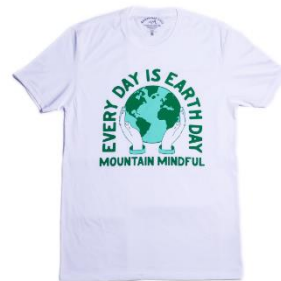
Earth Day 2022 Tee