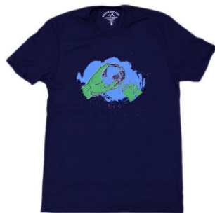
Heirloom Earth Tee